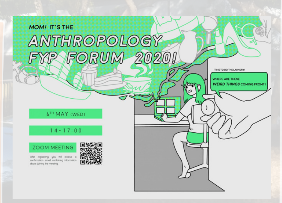
2020 Final Year Project Forum