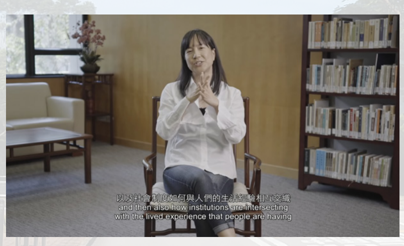
Anthropology: What and Why?