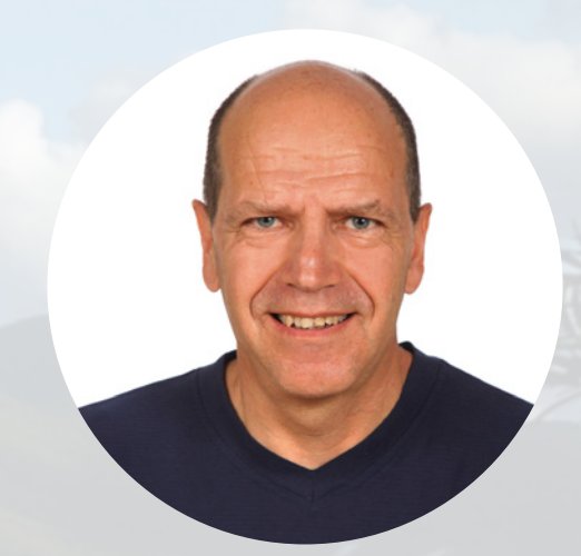
Prof. Andrew Kipnis

Anthropologists study human behavior from the widest possible vantage point. We try to see individual humans in a holistic frame, understanding their lives from every possible angle, and in comparison to humans from different time periods, different countries, different occupations, and different identities. This broad way of looking at humans is especially valuable in today's rapidly changing world. As our climate evolves, as technological development speeds ahead, and as political revolutions recur, it becomes harder and harder to imagine what Hong Kong and what the world will look like in the decades to come. Anthropology gives us tools to cope with change, to imagine possible and desirable futures, and to design ways of improving our world.